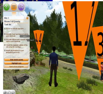
Virtual Skiddaw: 3D Geology Field Trips (Unity 3D)